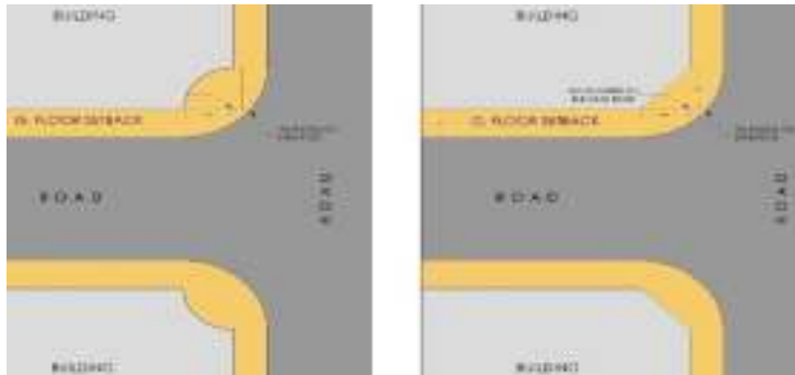
Figure 72 Corner articulation

Buildings located at the corner of intersection/T-intersection plays an important role for Heritage Precinct Area as well as for the entire Planning area. Hence such Buildings shall have to provide a chamfer of 3m or rounded corner with 3m radius.