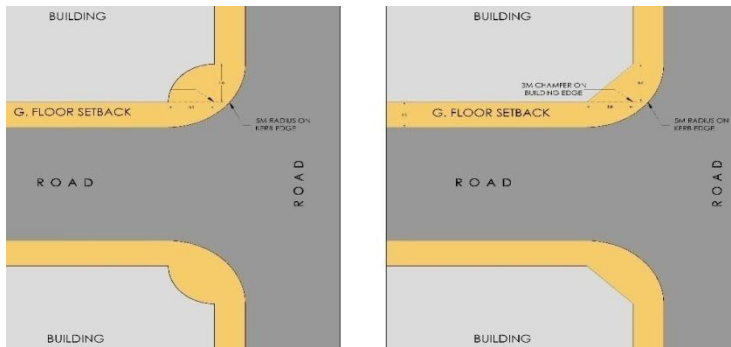
Figure 72 Corner articulation

Buildings located at the corner of intersection/T-intersection plays an important role for Heritage Precinct Area as well as for the entire Planning area. Hence such Buildings shall have to provide a chamfer of 3m or rounded corner with 3m radius.