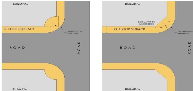
Figure 72 Corner articulation

Buildings located at the corner of intersection/T-intersection plays an important role for Heritage Precinct Area as well as for the entire Planning area. Hence such Buildings shall have to provide a chamfer of 3m or rounded corner with 3m radius.