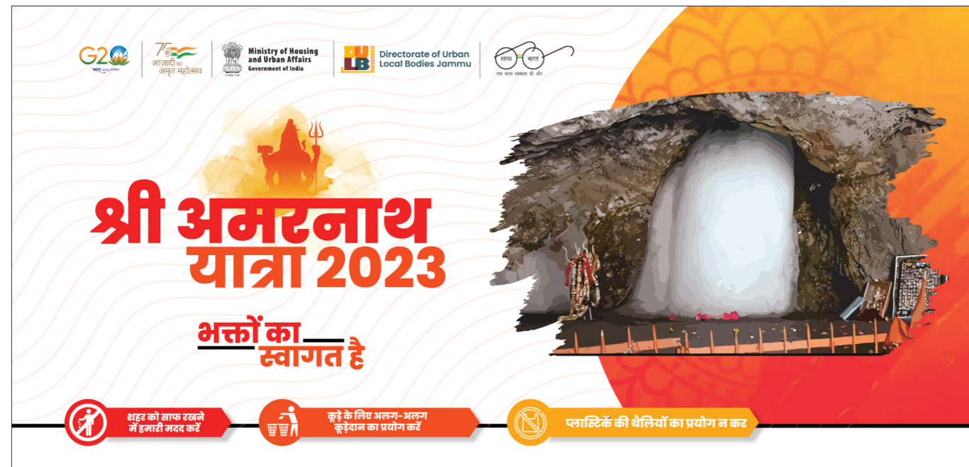
Banner Designs for Shri Amarnath Yatra